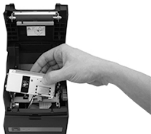
Easy Maintenance for Cutter, Print Head and Platen